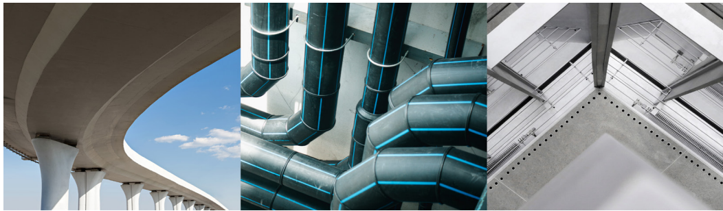
Figure 2. Concrete, plastic and metal are just a few examples of materials being re-engineered into hybrid compositions, which require materials testing to ensure structural integrity and product safety.

This has also led to inventive methods of sourcing raw materials, such as the development of innovative and hybrid materials for a number of industries across the manufacturing spectrum. Some examples include newly engineered advanced composites, fiber-laden concrete and additive manufacturing of superalloys. (Figure 2)