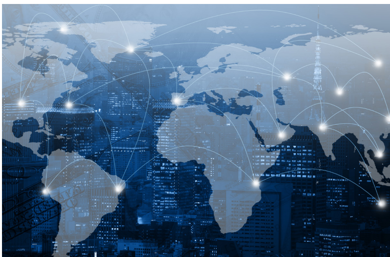
Figure 1: The global economy impacts today's manufacturing environment

Quality and quantity. In today's global economy, being able to deliver on both of these manufacturing parameters is proving to be the new norm. The rapid pace of expanding manufacturing demands is saddled against a company's ability to increase yield, maximize operational efficiencies and ultimately deliver high quality products.