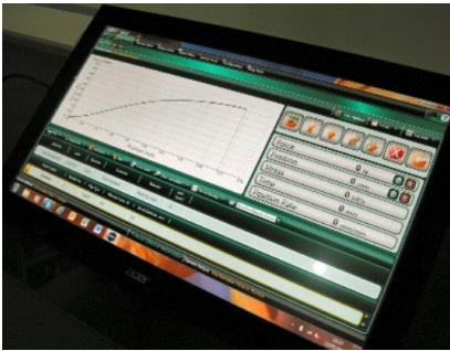
Figure 4: Analyzing data obtained from a materials testing environment helps add new layers of understanding to how materials behave during testing.

This leading-edge method of data analysis uncovers new insights into material behavior and accelerates the development of new materials with improved properties, such as allowing for more accurate predictions of material behavior and improved understanding of the underlying mechanisms that govern material deformation and failure.