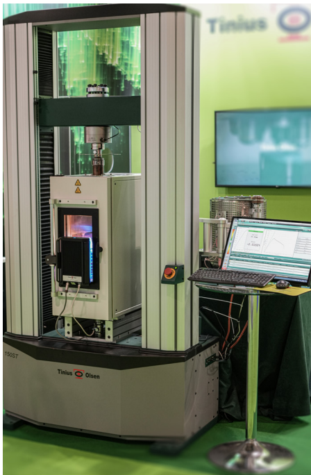
Figure 3: Consisting of a frame, chamber, sensors, specimen holders and software to help manage and analyze system data, modern elevated temperature testing systems offer comprehensive analysis and evaluation.

Advanced instrumentation and control technology such as high-temperature furnaces and specialized testing frame and software configurations are now capable of applying precise loads, strains and temperatures to the specimens under test. This delivers improved accuracy and repeatability and equates to more reliable data. Researchers can then make more detailed predictions about material behavior under extreme conditions. (Figure 3)